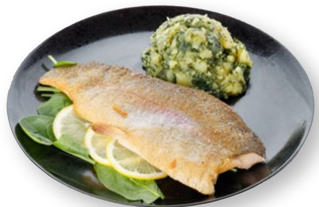
File postrvi s krompirjem in blitvo Trout fillet with potato and chard

In seveda, vedno je prostor še za sladico.