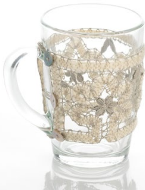
Skodelica s klekljanim plaščkom A mug with a lace cosy

Pitje kave ali čaja je užitek, ki ga še povečata dobra družba in lepa skodelica. Klekljan plašček iz lokalne ovčje volne in lanu pa bo krasil in grel vaše roke.