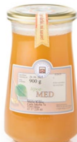
Lipov med Liden honey

Izvrsten med z znakom geografskega porekla »slovenski med« z območja Geoparka Idrija. Z značilno svežo aromo in vonjem po lipovem cvetju.