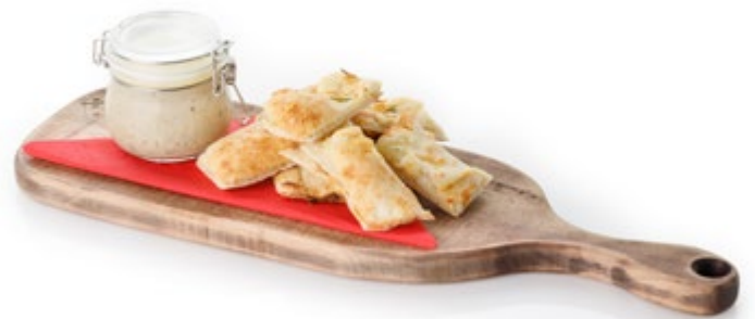
Postrvino pašteto , postreženo s sveže pečenimi kruhki Trout pate, served with freshly baked bread

For those who enjoy fish , Barbara Inn recommends the following dishes made from fish from the Libo fish farm, Gorenja Trebuša: