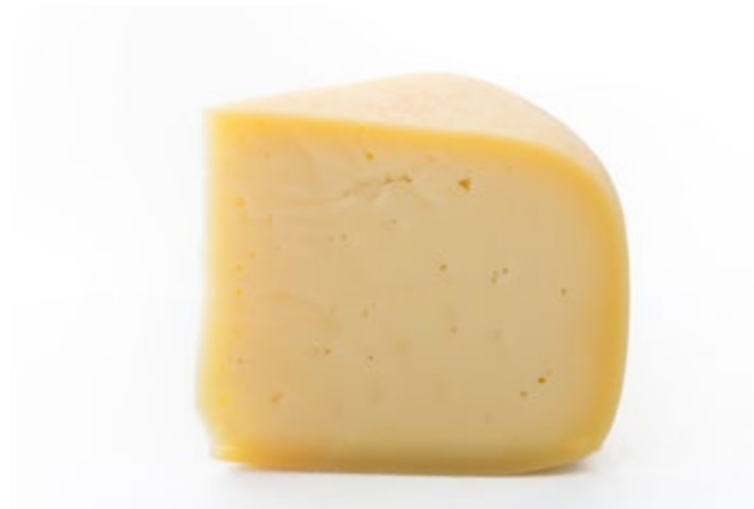
Kendov sir Kenda cheese

Made from whole cow's milk. The cream that forms on the top gives it a special, full flavour.