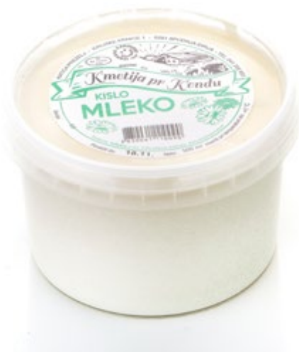
Kislo mleko Curdled milk

Katica Prezelj, dop. dej. na kmetiji Idrijske Krnice 1, 5281 Spodnja Idrija e: katica.prezelj@gmail.com , kmetijaprkendu1@gmail.com m: +386 (0)41 205 903