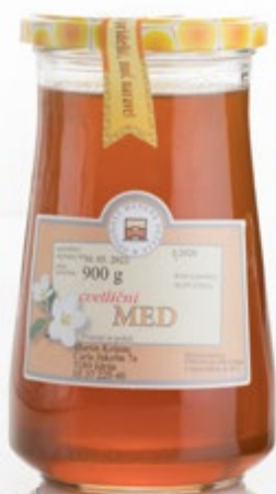
Cvetlični med Flower honey

Čebelarstvo Martin Kolenc Carl Jakoba 7a, 5280 Idrija e: martin.kolenc1@gmail.com m: +386 (0)5 37 220 40