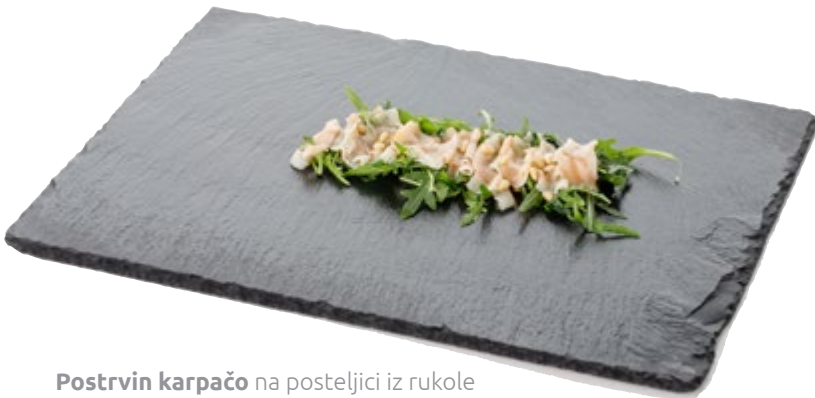
Postrvin karpačo na posteljici iz rukole Trout carpaccio on a bed of arugula