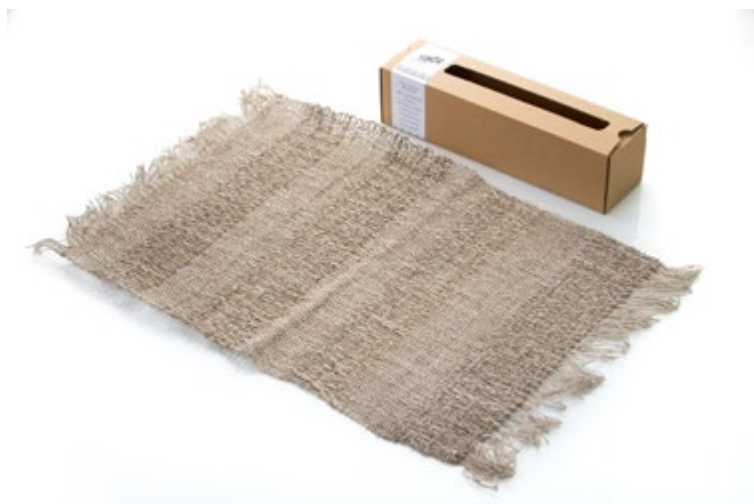
Lanen prticek – pogrinjek. Linen napkin

All products are hand-woven from flax tow made in Črni Vrh region.