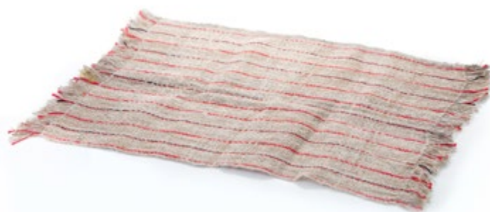
Lanen prticek z vtkano rdeče-črno bombažno prejo Linen cloth woven in combination with red and black cotton yarn.

Za dekoracijo doma v naravnih materialih.