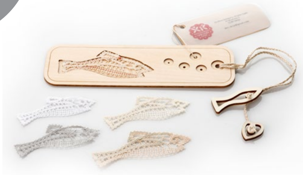
Knjižna kazalka s klekljano ribico Lace fish wooden bookmark

Leseni knjižni kazalki je dodana ročno klekljana ribica, ki je nastala pod pridnimi rokami klekljaric. Izdelek je navdihnila pr'farska legenda o ribi, ki na topolu poje.